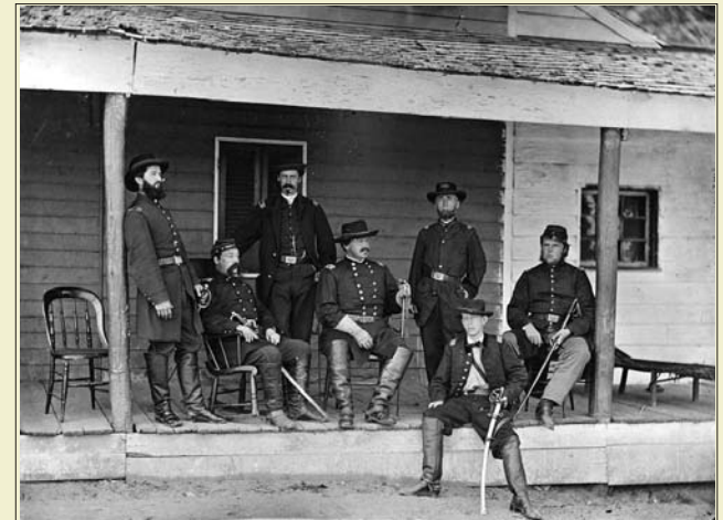
GENERAL ALEXANDER McCOOK AND HIS STAFF

It was called Fort Thomas during the Chickamauga Campaign when occupied by General John M. Brannan's division of Thomas' 14th Army Corps. General Brannan had his men build a pontoon bridge over Battle Creek, and began using scrap lumber to construct rafts to get the division over the river. "I commenced to cross with the entire division and completed the crossing on the 2d of September, with the ammunition and baggage trains, having previously sent the supply train by way of Bridgeport. The crossing was rendered most tedious and protracted from having no