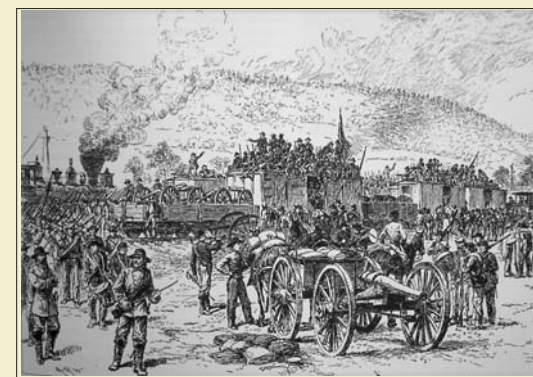
LONGSTREET AT CATOOSA STATION

The cannon fire alerted Confederate infantry regiments that were in camp in the southeastern end of the gap. Unknown to the Federals, massive reinforcements for Bragg's army had been coming by train from Virginia and Mississippi. The