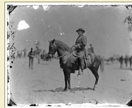
GENERAL ALEXANDER McCOOK

----- September 8, 1863--8:00 a.m. Confederate General Nathan Bedford