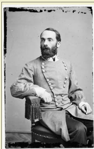
GENERAL JOE WHEELER

In late August 1863, the Federal Army of the Cumberland began moving toward Georgia. On the extreme right of the Federal lines, the XX Army Corps,